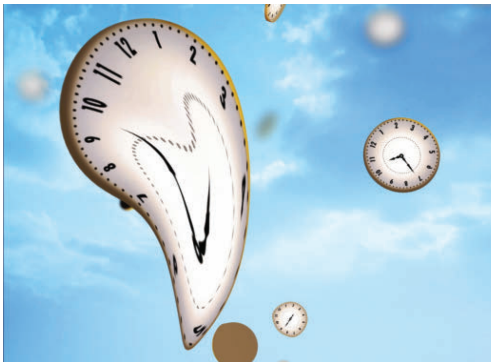
Data can be compressed using ‘warping,’ a method that outperforms existing technologies such as JPEG for images.

The research was published in Applied Optics (doi: 10.1364/ao.52.006735).